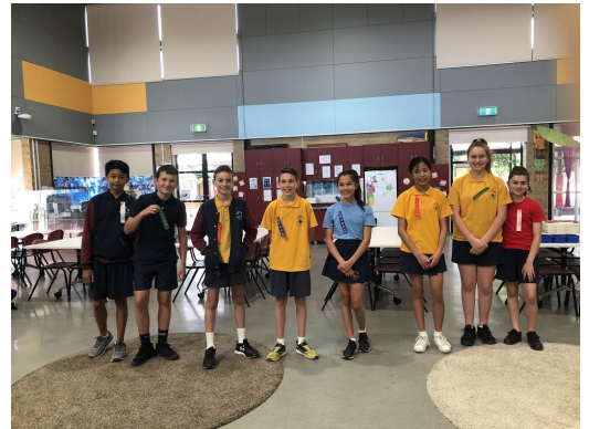
Year 6 children placed 1st - 4th in the Cross Country Race

On this day, could all Grade 3 children please wear a top/t-shirt representing their house (team) colour.